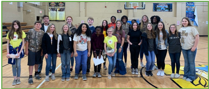
2021-22 StuCo Candidates